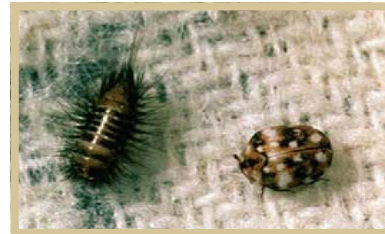
Adult carpet beetles