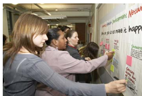
CHD Network Launch Event

In March 2007, the Leeds Community Health Development Network was formally launched with an event held at the local Carriageworks Theatre. The launch event proved very successful and provided an opportunity for a wide range of agencies to help shape the role of the Network, encouraging greater ownership. A DVD and detailed report of the launch event was produced and is available from the Healthy Leeds Partnership.